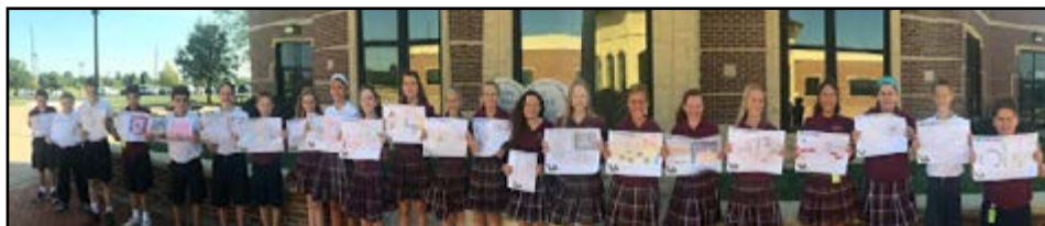
8th Graders posing with their book covers and reviews.

Music: 3rd grade students are learning about the different families of instruments found in an orchestra: woodwind, brass, string, and percussion. They listen to various sound bits to learn and practice identifying what each family sounds like as individual groups.