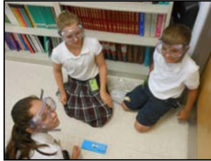
6th Graders testing a hypothesis.

8th Grade: In English class, 8th graders did an awesome job writing book reviews and creating book covers of their favorite novels! In their reviews, they used persuasive techniques to recommend books to their peers. In U.S. History, the students reviewed American history from the exploration to the winning of the Revolutionary War. Several weeks ago we began learning about our new nation forming a government and blood, sweat, and negotiations that it took to make our nation great.