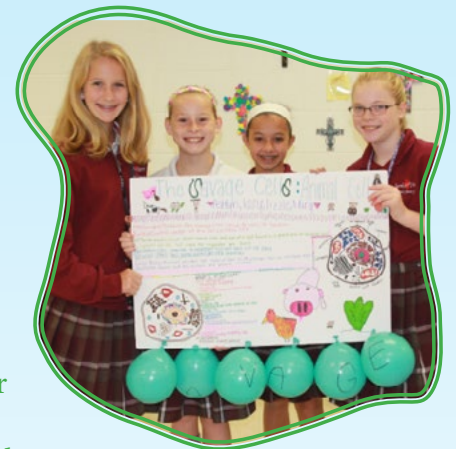
7th graders showed off their selling skills by presenting an advertisements using various food products to represent the parts of a cell. By the end of presentations, the audience chose which product they wanted to make as a class.